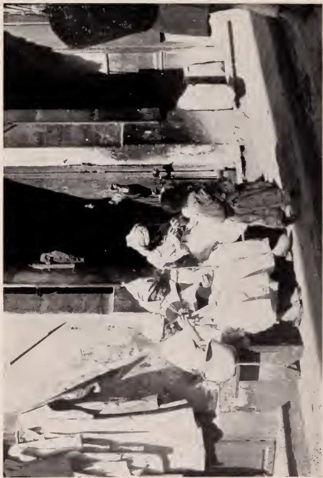
Outside a coffee-house in a mountain village, in Kabylia. Under French control much of the old-time barbarity of the region is passing away